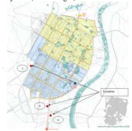
Fig. -2: location of over flow sewer

Location1: Urjanagar 1Randesan, Gandhinagar, Gujarat 382421, (23.184151, 72.641318)