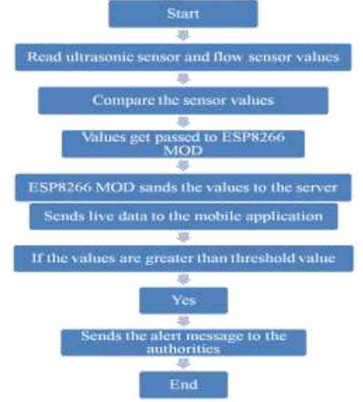
Fig. -3: Methodology of system